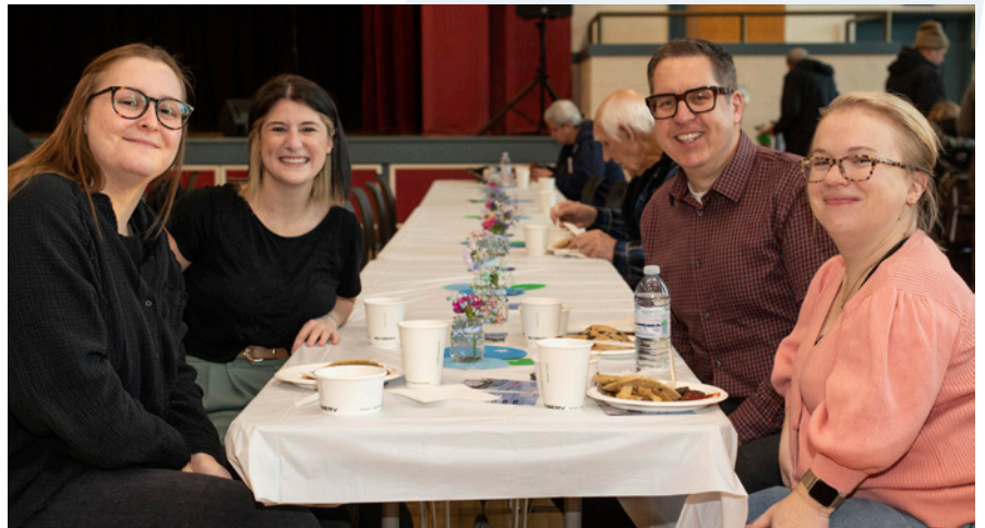
TOP IMAGE: Members of Winnipeg's CED community attend a panel at Siloam Mission on social enterprises.