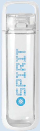
SPIRIT OF COMMUNITY WATER BOTTLE

You can find these online at: shop.lite.mb.ca