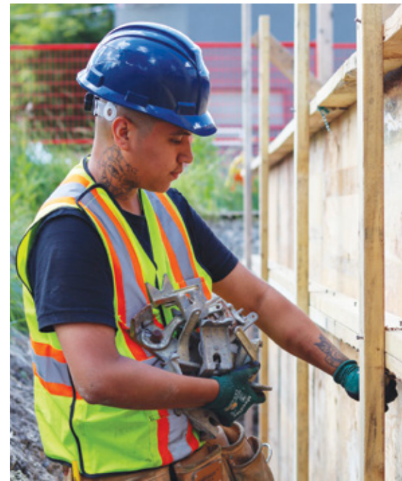
Construction work placement, Purpose Construction

“Our hamper recipients loved the cookies and curry lentil soups this year! Our participants packing the hampers are grateful for the honoraria we provide, offering that “little extra support.”