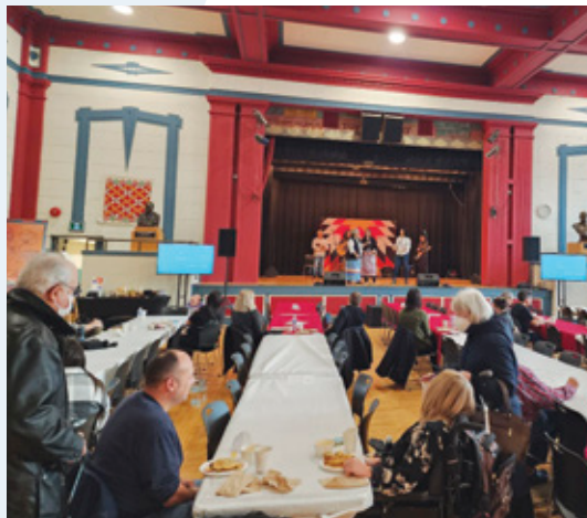
LITE's 25 th Annual Wild Blueberry Pancake Breakfast

LITE's work would not be possible without financial support from these important program funders.